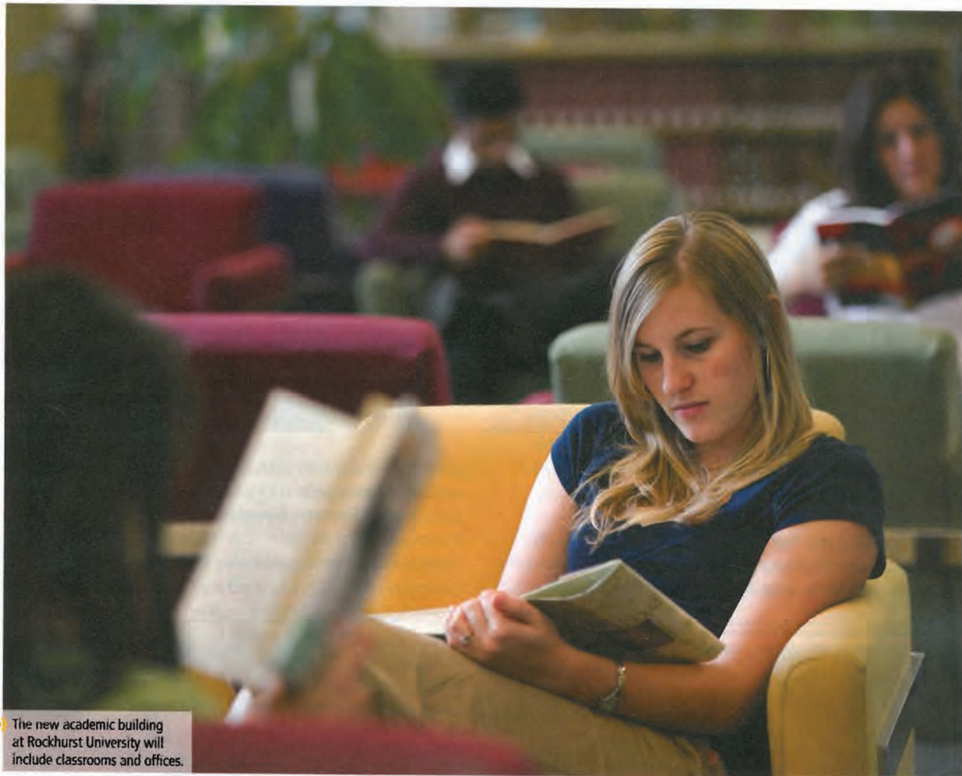
The new academic building at Rockhurst University will include classrooms and offices.