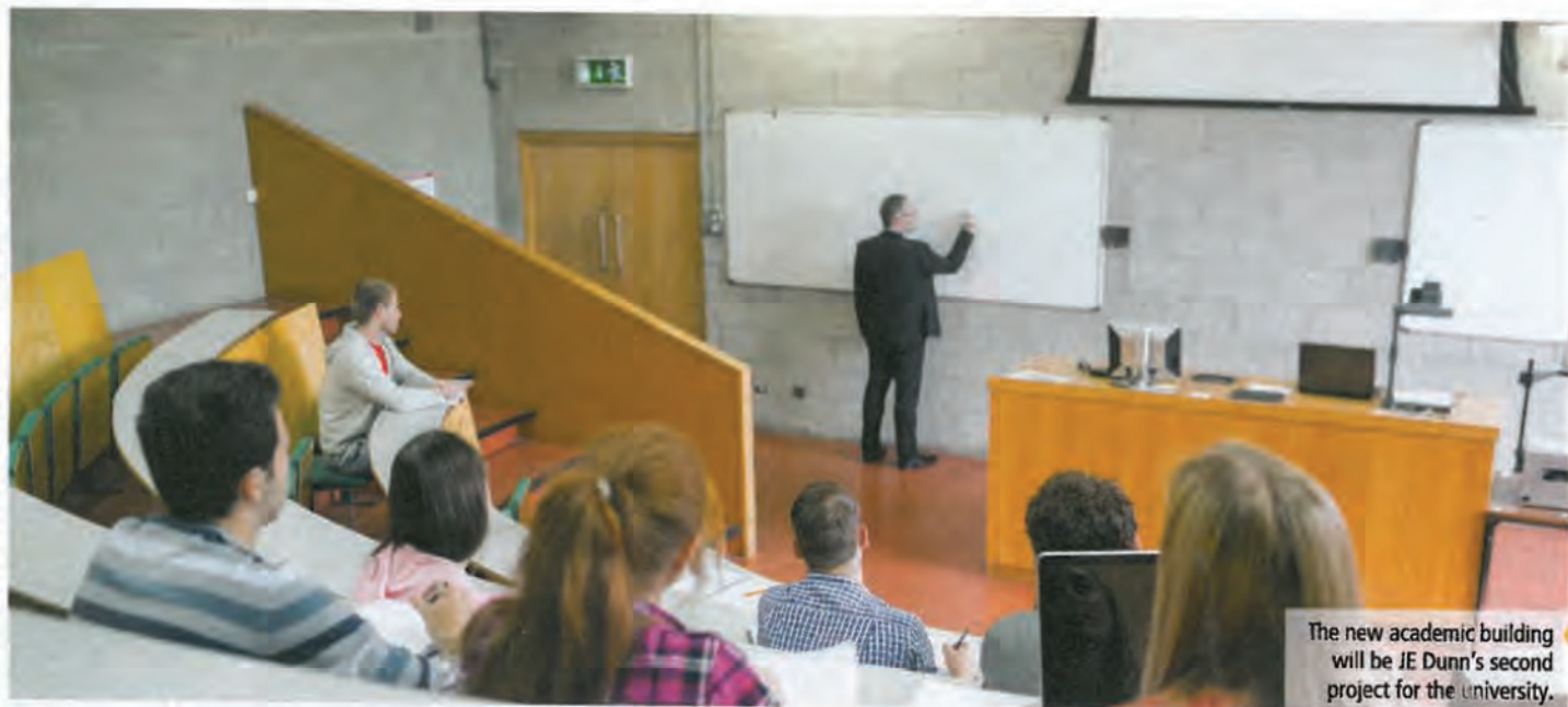
The new academic building will be JE Dunn's second project for the university.

The university raised $24.5 million by June 2013. Gould Evans is the architect on the project.